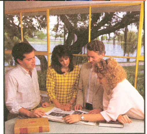
As Interim Dean with students, 1983